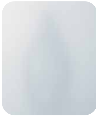
The obscuration achieved with a vase 20cm from Pilkington Optifloat™ Satin.