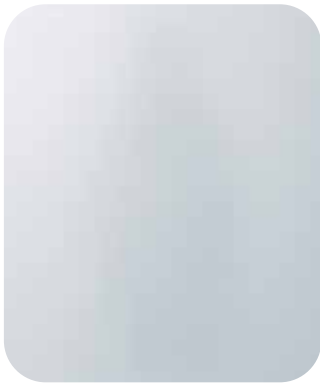
The obscuration achieved with a vase (as shown on the front cover) 40cm from Pilkington Optifloat™ Satin.