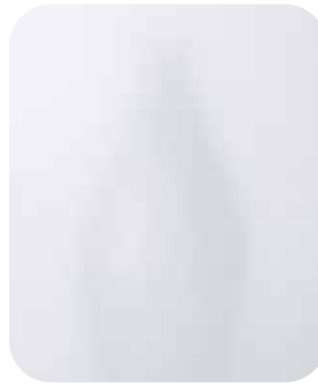
The obscuration achieved with a vase 1cm from Pilkington Optifloat™ Satin.